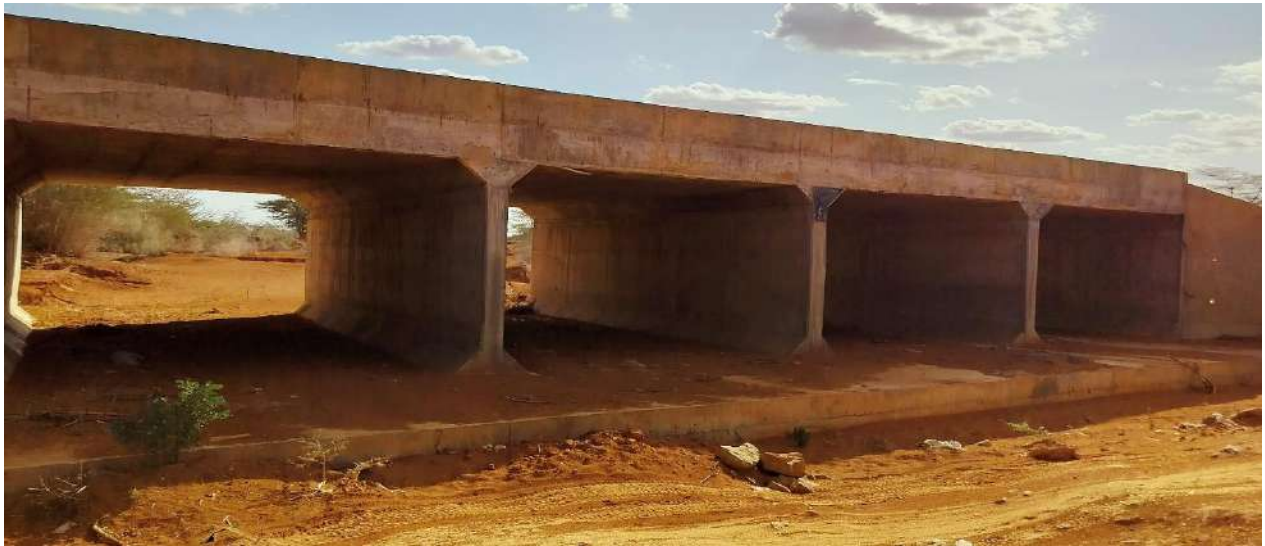
Photo 2: On-going construction of the Hareri Culvert Box project 1