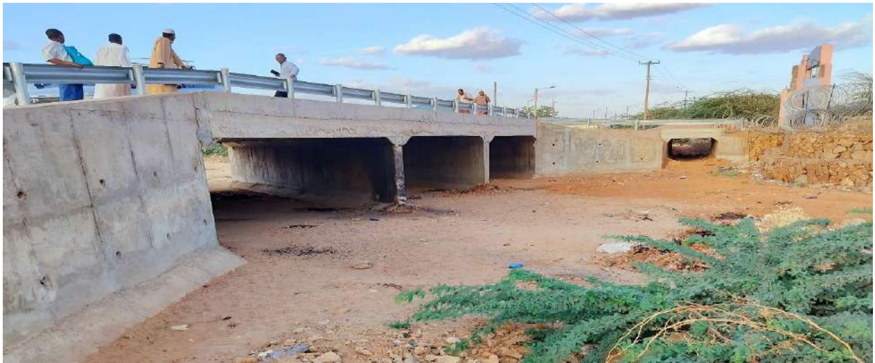
Photo 2: Completed Mandera Livestock Market Culvert Box which is usable to the public