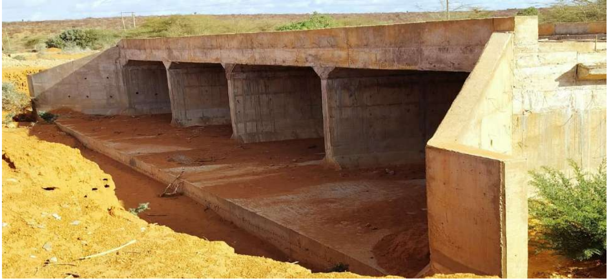
Photo 3: On-going construction of the Hareri Culvert Box project 2