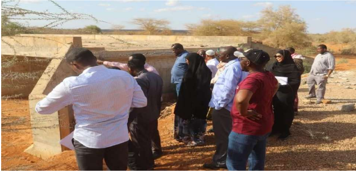
Photo 1: Committee inspecting ongoing construction of Hareri Culvert Boxes with accompany of technical team from the Department of Roads and Transport