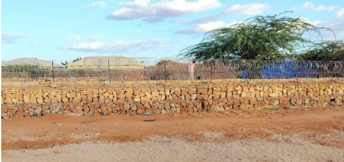
Photo 3: Installation of Gabions on the sides of the stream waterways

During the visit to Livestock Market Culvert the committee made the following site observations