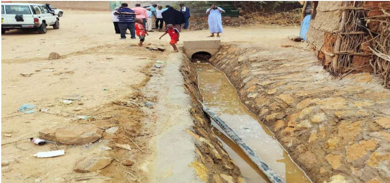
Photo 4: Blocked drainage system along Malka Punda road making it difficult to remove unwanted water from residential environment