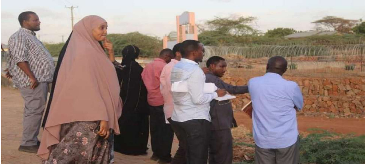
Photo 1: Committee inspecting construction of Mandera Livestock Market Culvert Box