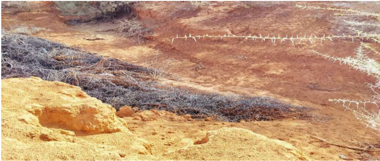
Photo 4: Section of the non-perennial stream where construction of the Hareri Culvert Box is implemented. Due to lack of installation of Gabions on either sides of the waterways the area where the projects is implemented is heavily affected by soil erosion and this make Hareri road impassable during rainy seasons.

During the visit to Hareri Culvert Boxes the Committee made the following site observations