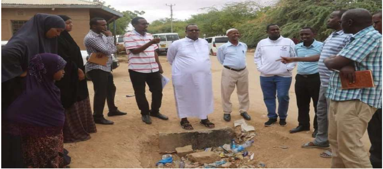
Photo 1: Committee inspecting culvert box located at joint intersection of Malka Punda road and road 5 which is completely blocked and silted