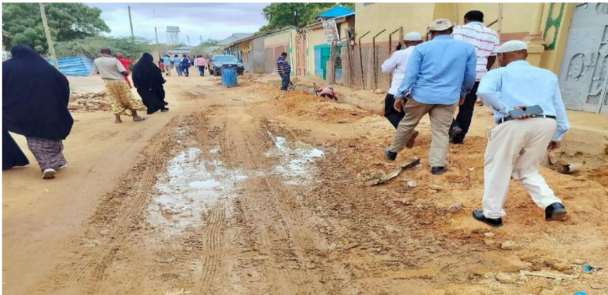
Photo 2: Section of Malka Punda road which is untarmacked, in deplorable state and impassable during rainy seasons.