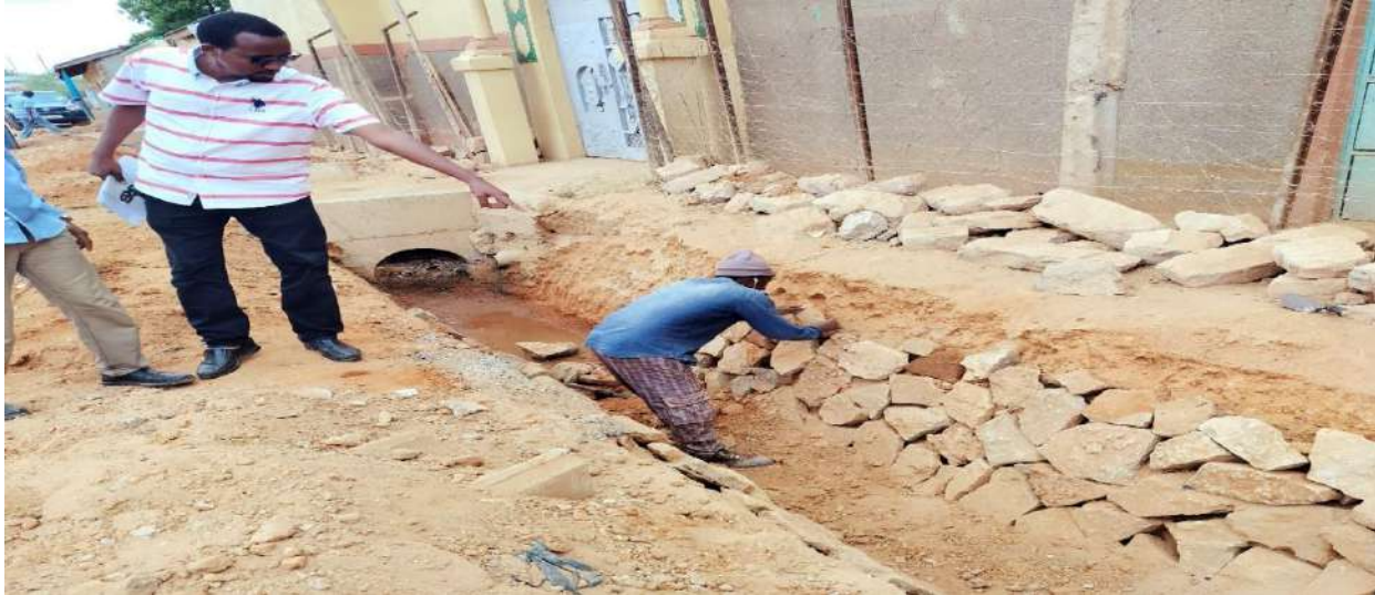
Photo 5: Malka Punda road construction worker installing Stone Pitching

During the visit to Malka Punda Road project the committee made the following site observations