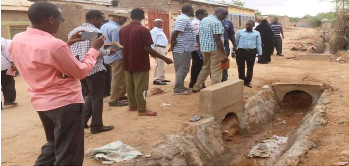
Photo 3: Cross and access culvert box along the Malka Punda road in residential area which is blocked and silted